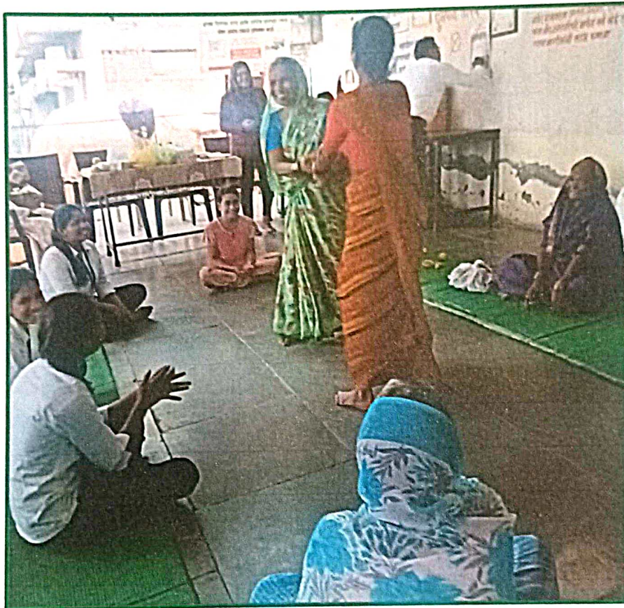
Students interaction with the senior citizens