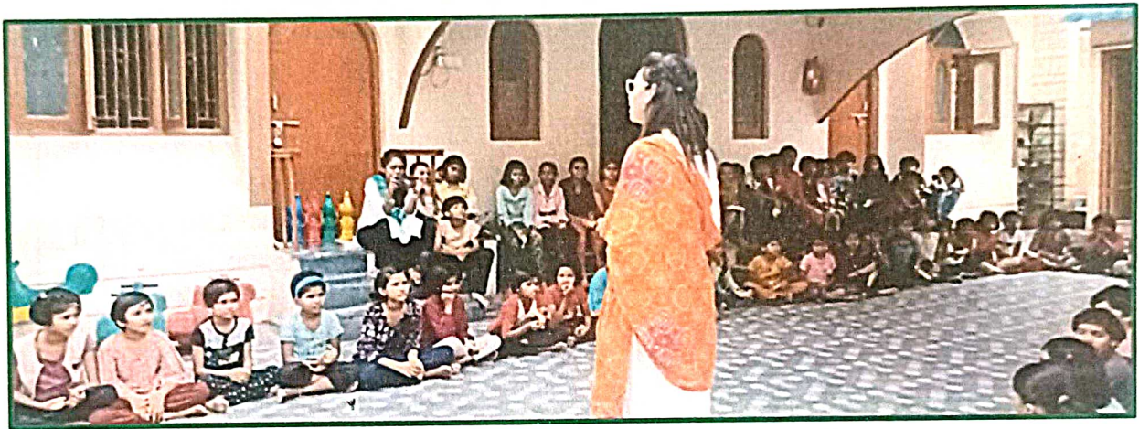
Interaction with the children