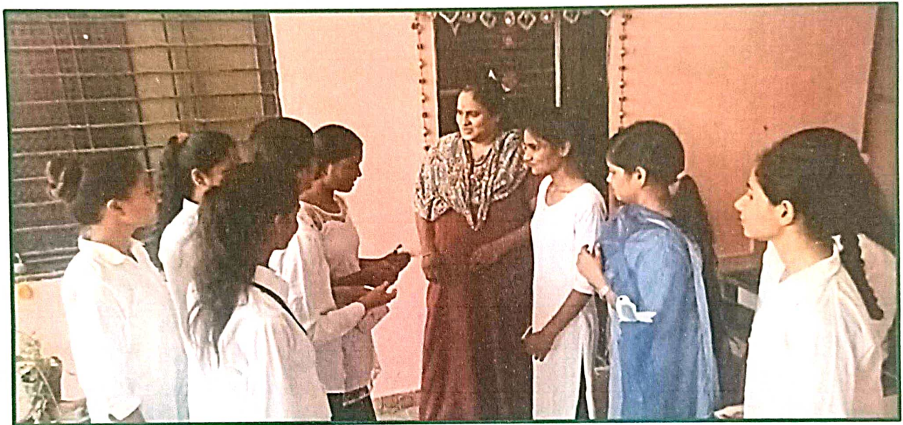
Students explaining about energy conservation by visiting a household

Title: Empowering Households for a greener tomorrow: energy conservation initiative