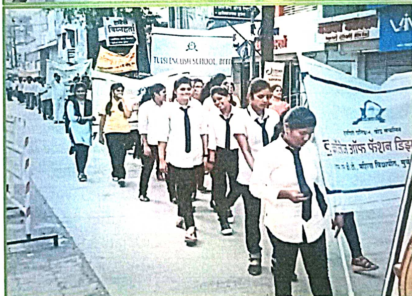
Photographs of students on rally