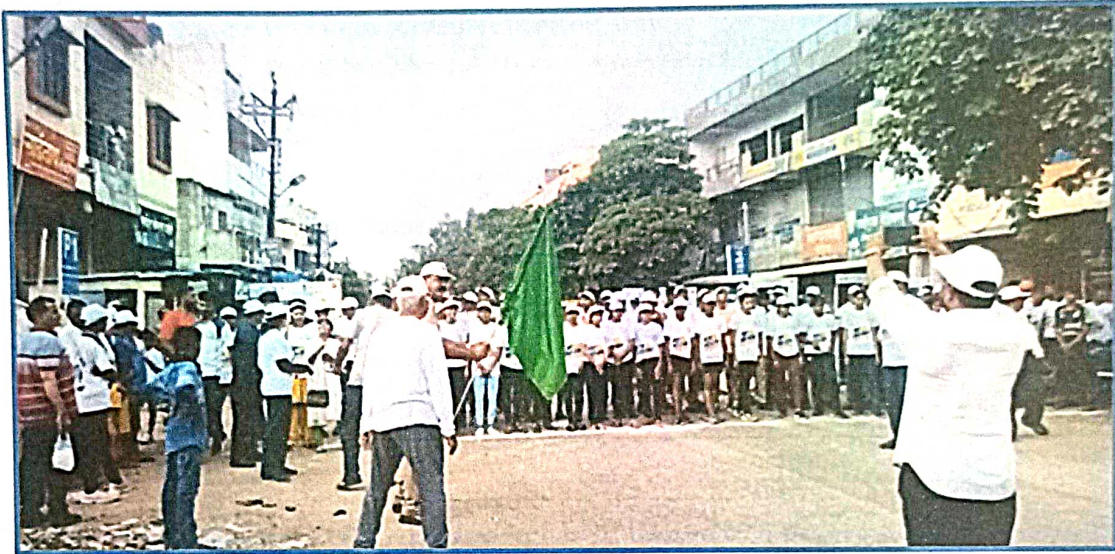
Students participating for the walk

Organized by: Tulsi college of Fashion Design, Beed