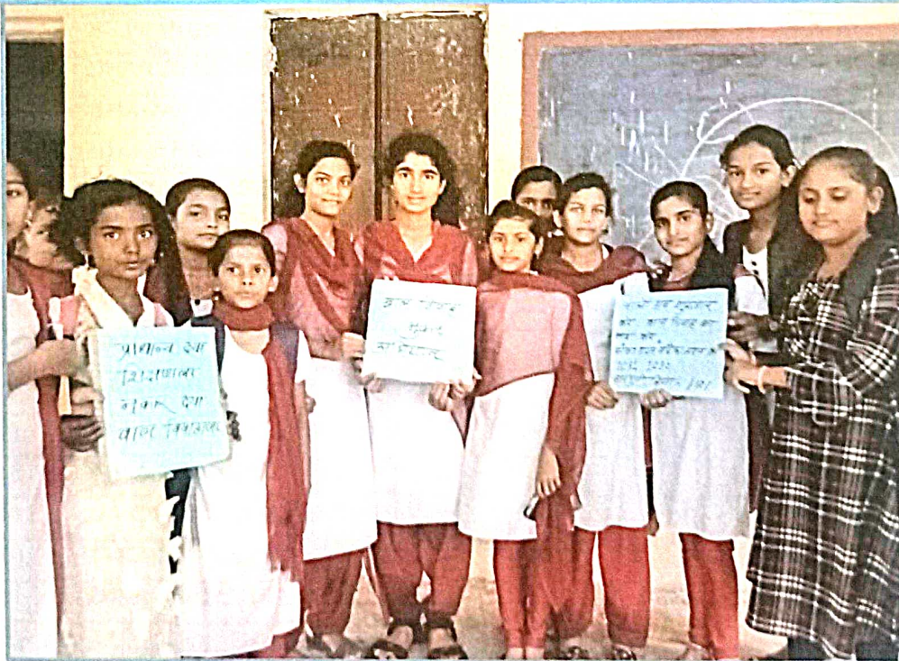
Photograph of campaign in Schools at Beed