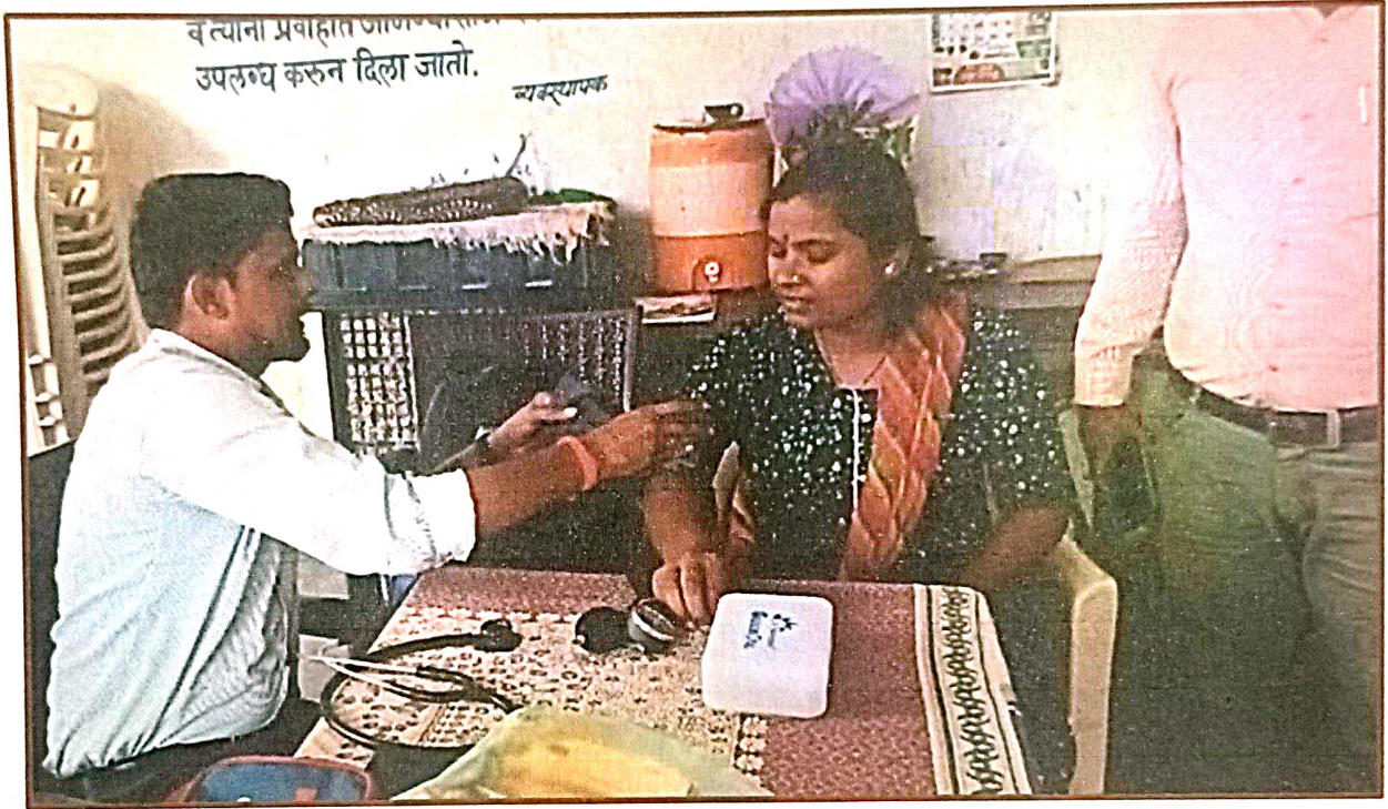
Health check up of the participants